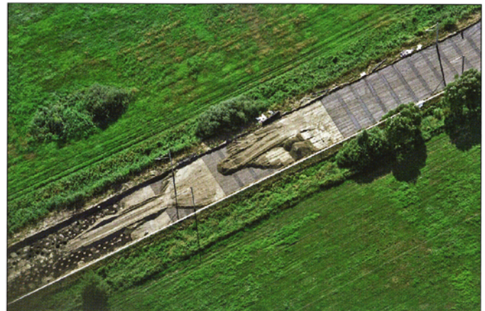
↑ Figure 3 Paulinenaue section. Three layers of PVA Fortrac® geogrid were placed at 300 mm vertical spacings

the actual use of counter pressure in design calculations. Lowering the ground water level could already eliminate all counter pressure.